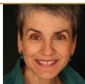
Frances Moore Lappé